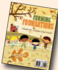
Forming Foundations For Primaries Ages 6-8