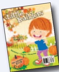
Little Builders For Beginners Ages 4-5

Colorful, engaging, and fun, our newly designed take-home papers are full of articles and activities that point kids to the truth of God's Word!