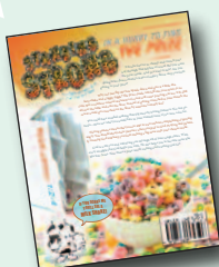
Standing Strong For Juniors Ages 9-11