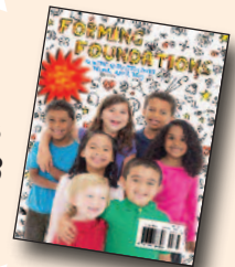
Forming Foundations For Primaries Ages 6-8