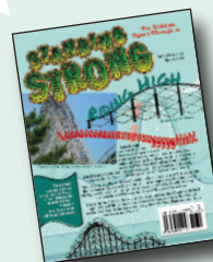
Standing Strong For Juniors Ages 9-11