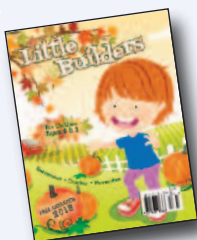
Little Builders For Beginners Ages 4-5

Colorful, engaging, and fun, our newly designed take-home papers are full of articles and activities that point kids to the truth of God's Word!