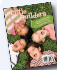
Little Builders For Beginners Ages 4-5

Colorful, engaging, and fun, our newly designed take-home papers are full of articles and activities that point kids to the truth of God's Word!